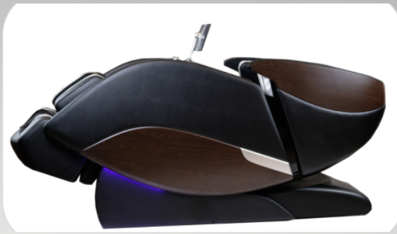
Set the Mood

With Features such as adjustable mood lighting and built in relaxation sounds the atmosphere is set for the perfect massage. Feel your stress fade away as you immerse yourself in The Galaxy 2022.